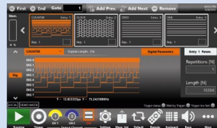
Digital Pattern Generation (DPG functionality)