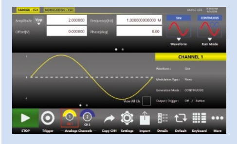
Arbitrary Function Generation (AFG functionality)