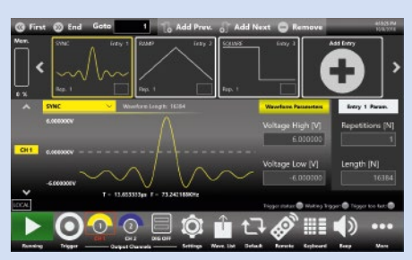
Arbitrary Waveform Generation (AWG functionality)